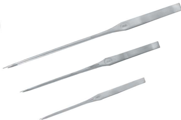
PINSETTES 106-001 / S 106-002 / M 106-003 / L

The initial planting is a very important process which has to be done precisely and delicately. In particular, in the Nature Aquarium, which is an attempt to create Nature within the aquarium, the importance of the planting, comes first. ADA Pinsettes are designed solely for the planting of aquatic plants with the best utility. Meticulously hand made for accurate joint of 'the fingers' and the optimal hardness of the 'spring' based on thorough researches on the human technology. Available in 3 sizes to apply to all kinds of aquatic plants or purposes.