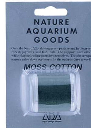
MOSS COTTON 106-033

A special cotton thread to fix Willow Moss on driftwood or rocks. Made of quality cotton material which allows firm fixation of Willow Moss on various layout materials and will naturally biodegrade after Willow Moss has taken root to the driftwood or rocks. In a quiet dark green color similar to that of Willow Moss.