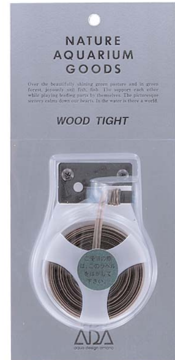
WOOD TIGHT 106-034

Wire designed to temporarily fix ferns such as Microsorium or Bolbitis on driftwood or rocks, until the plant roots takes hold by themselves. In a brown color that matches that of driftwood. Remove carefully after the plant takes firm root on driftwood or rocks.