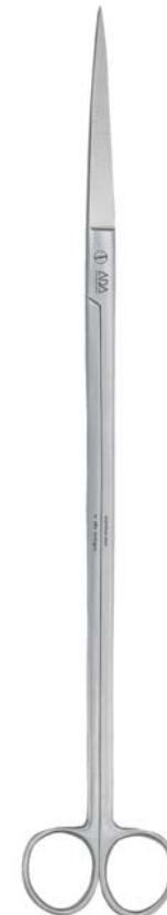
TRIMMING SCISSORS 106-011

Improper insertion of substrate fertilizers (Multi Bottom and Iron Bottom), sometimes causes water-cloudiness or algae development. Bottom Release is a specially designed injector for ADA substrate fertilizers.