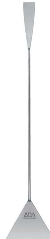
SAND FLATTENER 106-021

In order to maintain the condition of planted aquariums, aquatic plants need to be trimmed regularly and withered leaves have to be removed carefully. With ADA Trimming Scissors, such work can be done easily and precisely. Long and narrow blades allow delicate operation even in small spaces. The shape of the handles are designed to perfectly fit your hand.