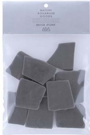
RICCIA STONE 106-031

Although Riccia is by nature, a surface plant, it can be beautifully grown underwater, however, if not fixed properly on stones or driftwood, it would float and grow on the water surface. Riccia Stone is a layout material to fix Riccia on with Riccia Line. The flat shapes of Riccia Stone, allow the creation of a beautiful foreground carpet of Riccia.